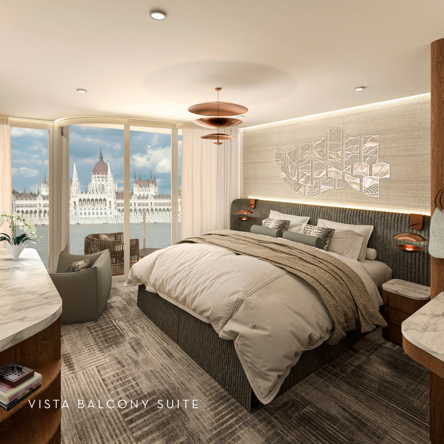
VISTA BALCONY SUITE